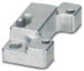
Panel mounting flange for HEAVYCON ADVANCE TMB housing with bayonet locking