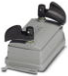
HEAVYCON ADVANCE IP65 protective cover B6, with bayonet locking, with retaining cord, diameter of retaining cord eyelet 3 mm

Protective covers - HC-B 6-TMB-SD-IP65 - 1690930