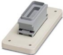
Adapter plate, size B16, reinforced, including panel mounting frame with DSUB 15 protective cover and without contact insert

Please be informed that the data shown in this PDF Document is generated from our Online Catalog. Please find the complete data in the user's documentation. Our General Terms of Use for Downloads are valid ( http://download.phoenixcontact.com )