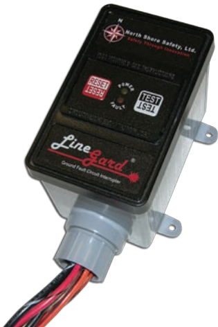
Flying Leads (Splice-in)