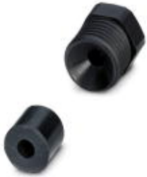
Sensor/actuator connector, accessories, pressure screw and Pg7 seal, for unshielded M12 connector, cable diameter 2.5 mm - 3.5 mm

Please be informed that the data shown in this PDF Document is generated from our Online Catalog. Please find the complete data in the user's documentation. Our General Terms of Use for Downloads are valid ( http://phoenixcontact.com/download )