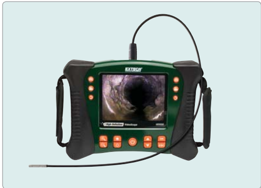
HDV610 VideoScope with 5.5mm diameter flexible probe (1m length)