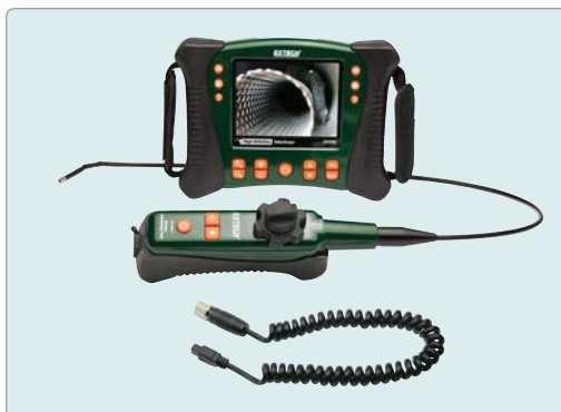
HDV640W VideoScope, wireless handset & 6mm diameter semi-rigid articulated (240°) probe