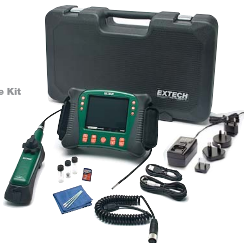
HDV640 Complete Kit

The HDV600 series is designed with capabilities and accessories to give you a rolling start while still permitting you to expand functionality as your needs change.