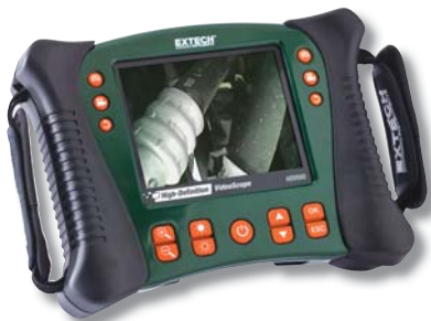
HDV600 Display Unit

You may also configure customized solutions by starting with an HDV600 display unit (no probe included) and selecting optional probes and/or handsets listed above.