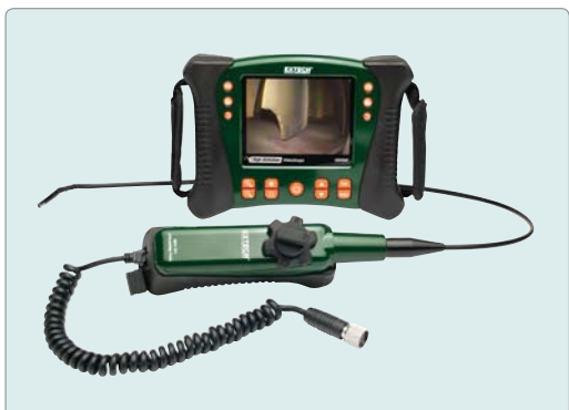
HDV640 VideoScope, wired handset & 6mm diameter semi-rigid articulated (240°) probe