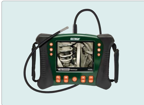
HDV620 VideoScope with 5.8mm diameter semi-rigid probe (1m length)