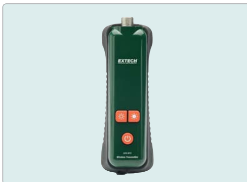
HDV-WTX Universal wireless handset, accepts several scopes of varying diameters, lengths, and flexibility