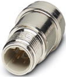
Sensor/actuator flush-type plug, 5-pos., M12, B-coded, front/press-in mounting, with straight solder connection

Please be informed that the data shown in this PDF Document is generated from our Online Catalog. Please find the complete data in the user's documentation. Our General Terms of Use for Downloads are valid ( http://download.phoenixcontact.com )