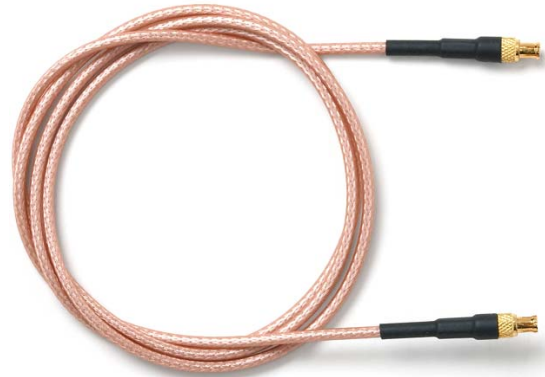
Model 73075-VV MCX Plug to MCX Plug, RG179B/U, 75 Ohm

Snap-on coupling and miniature size for fast connect and disconnect where space is limited