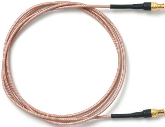
Model 73075-UU MCX Plug to MCX Plug, RG178B/U, 50 Ohm

MCX Plug to MCX Plug, RG178B/U (50 Ohm), RG179B/U (75 Ohm)