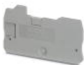
End cover, Length: 62.6 mm, Width: 2.2 mm, Color: gray