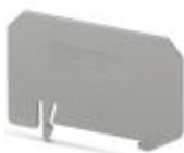
Partition plate, Length: 64.4 mm, Width: 2 mm, Height: 46 mm, Color: gray

DIN rail perforated - NS 35/ 7,5 PERF 2000MM - 0801733