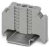
End clamp, width: 9.5 mm, color: gray