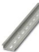
DIN rail, material: steel galvanized and passivated with a thick layer, perforated, height 7.5 mm, width 35 mm, length: 2000 mm

DIN rail perforated - NS 35/ 7,5 PERF 2000MM - 0801733