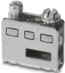
Branch terminal, Connection method Screw connection, Cross section: 0.5 mm 2 - 16 mm 2 , Width: 7.7 mm, Color: gray

Please be informed that the data shown in this PDF Document is generated from our Online Catalog. Please find the complete data in the user's documentation. Our General Terms of Use for Downloads are valid ( http://download.phoenixcontact.com )