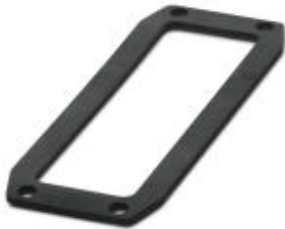
Replacement flat gasket, for HEAVYCON EVO panel mounting base type B24

Please be informed that the data shown in this PDF Document is generated from our Online Catalog. Please find the complete data in the user's documentation. Our General Terms of Use for Downloads are valid ( http://phoenixcontact.com/download )