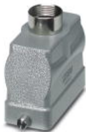
HEAVYCON B16 sleeve housing, for single locking latch, height: 65 mm, with 1 x M25 gland, straight cable outlet

Please be informed that the data shown in this PDF Document is generated from our Online Catalog. Please find the complete data in the user's documentation. Our General Terms of Use for Downloads are valid ( http://phoenixcontact.com/download )