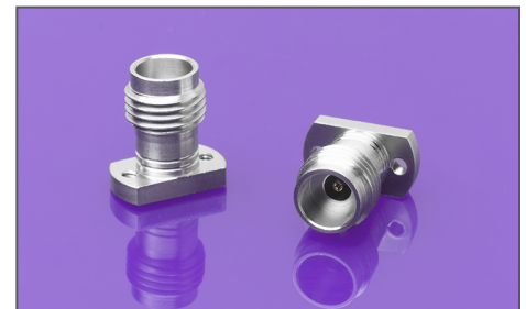
Precision Compression-Mount Microwave Test Connectors