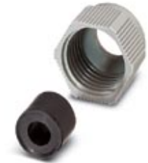
D-SUB cap nut with line seal, for sleeve housing VS-09-..., conductor diameter of 3 mm ... 6 mm

Please be informed that the data shown in this PDF Document is generated from our Online Catalog. Please find the complete data in the user's documentation. Our General Terms of Use for Downloads are valid ( http://download.phoenixcontact.com )