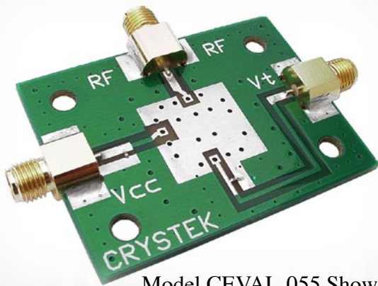
Model CEVAL-055 Shown