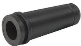
HN 14.40 PVC Strain Relief