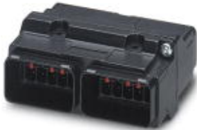
Power H distributor

Power H distributor, 4 x MSTB contact inserts, metal housing, without mounting screws