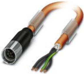
Cable plug in molded plastic, Length: 5 m, Color of outer sheath: orange RAL 2003

Please be informed that the data shown in this PDF Document is generated from our Online Catalog. Please find the complete data in the user's documentation. Our General Terms of Use for Downloads are valid ( http://phoenixcontact.com/download )