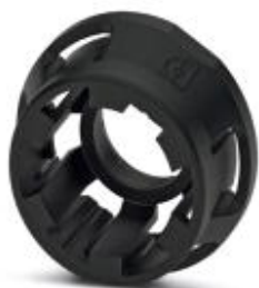
Fixing sleeve for M12 housing screw connection with tolerance-compensating function, for SMD-solderable M12 socket contact inserts.

Please be informed that the data shown in this PDF Document is generated from our Online Catalog. Please find the complete data in the user's documentation. Our General Terms of Use for Downloads are valid ( http://phoenixcontact.com/download )