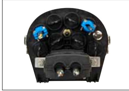
3M™ Fiber Dome Terminal Closure FDTC 08M and FDTC 08S Direct Splice Drop Termination Port Layout