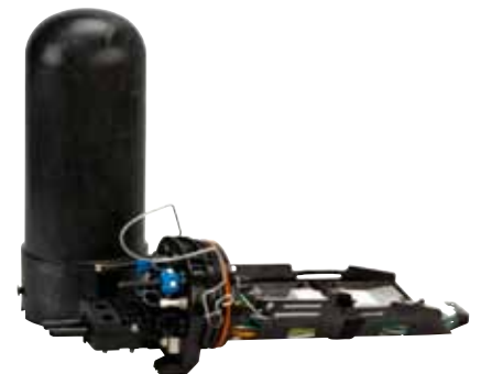
3M™ Fiber Dome Terminal Closure FDTC 08S Direct Splice Drop Termination