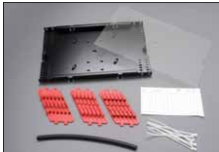
3M™ Fiber Optic Splice Tray 2538