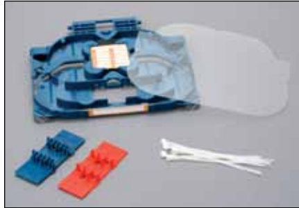
3M™ Fiber Optic Splice Tray 2540-12-SF/72-MF