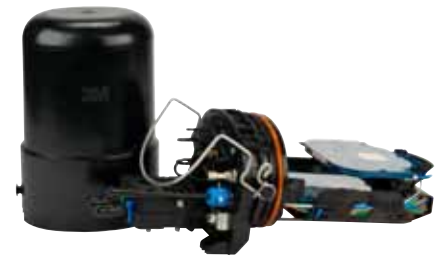
3M™ Fiber Dome Terminal Closure FDTC 08M Direct Splice Drop Termination

The fiber dome terminal closures FDTC 08M and FDTC 08S utilize the 3M External Cable Assembly Module (ECAM) built-in drop entry port system. The ECAM design allows true plug-and-play capability which may reduce installation and labor costs because the drop preparation is completed outside of the terminal closure body. Also, the built-in drop entry system allows the technician to add and remove drops without disturbing previously installed drops. The terminal closures FDTC 08M and FDTC 08S are Rural Development (RUS) Listed.