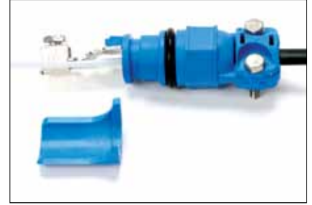
3M™ 12 mm External Cable Assembly Module (ECAM) Cable Entry Port