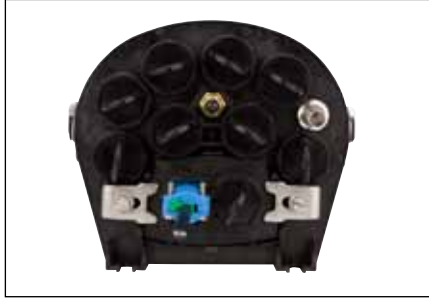
3M™ Fiber Dome Terminal Closure FDTC 08ME Direct Splice Drop Termination Port Layout

Each drop has a separate seal (grommet and O-ring), strain-relief bracket, and strength member retention lug.