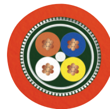
Sercos III [93K]