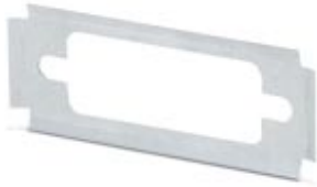
D-SUB EMC shroud, shell size 2, shielded, for panel mounting frame VS-15-...

Please be informed that the data shown in this PDF Document is generated from our Online Catalog. Please find the complete data in the user's documentation. Our General Terms of Use for Downloads are valid ( http://download.phoenixcontact.com )