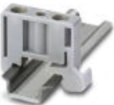
End clamp width: 6 mm, color: gray