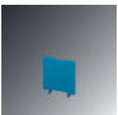
End cover, Length: 28 mm, Width: 2.5 mm, Color: blue