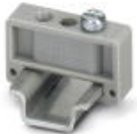
End clamp, width: 6.2 mm, color: gray