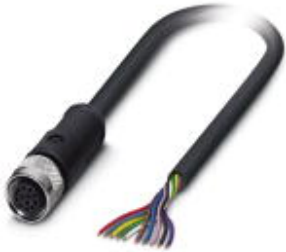
Master cable, 12-position, PUR/PVC, black RAL 9005, free cable end, on Socket straight M12, A-coded, Cable length: 10 m

Please be informed that the data shown in this PDF Document is generated from our Online Catalog. Please find the complete data in the user's documentation. Our General Terms of Use for Downloads are valid ( http://phoenixcontact.com/download )