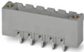
The figure shows a 5-pos. version of the product in gray

Header, Nominal current: 12 A, Rated voltage (III/2): 320 V, Number of positions: 11, Pitch: 5 mm, Color: pastel green, Contact surface: Tin, Assembly: Soldering